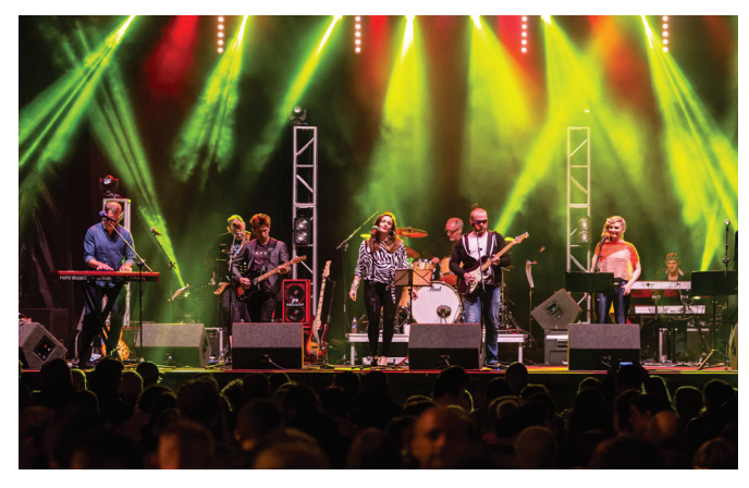
SLIGO SUMMER FEST

We will continue to raise sponsorship that allows the company to deliver many of its marketing objectives. We will support existing local events to enhance and improve the overall offering paying specific attention to Spring/Summer/Christmas.