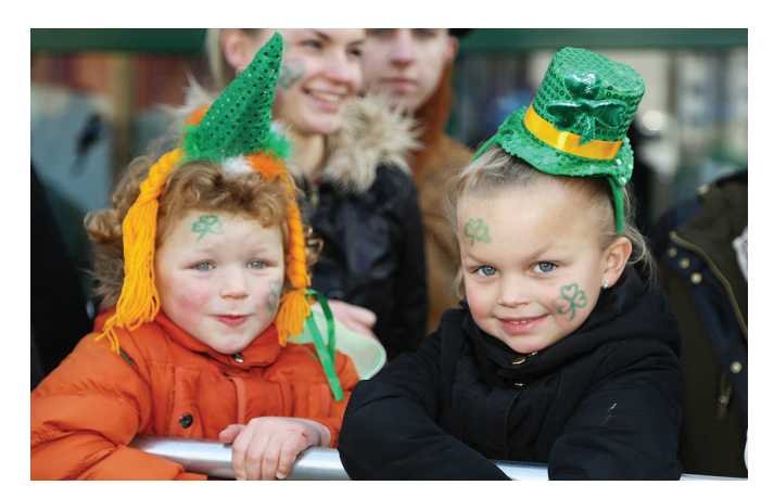
SLIGO ST PATRICKS DAY

Over the proposed five-year term there will be a notable increase in our operational delivery for the Town Centre, with many partnerships now formed, this leads to a speedier deliver within this service and will include.