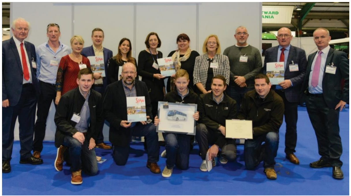
Sligo BID at Tourism Tradeshow, RDS

In 2015, Sligo joined Galway, Killarney, Waterford, Dublin, and Cork in securing Purple Flag accreditation. Recommended by Fáilte Ireland as a signature award for the Evening and Night Time Economy (ENTE), the Sligo cross sector stakeholder team is recognised by the Association of Town and City Management (ATCM), UK and Ireland as one of the best examples of a town team both here in Ireland and the UK. Sligo BID will continue to project lead the annual application necessary to retain the award. Sligo chairs the Irish network of towns and cities that hold the award and are members of the ATCM (23 Irish towns and cities) and are seeking representation on the newly formed Night Time Task force by the Department of Media, Tourism, Arts, Culture Sports and the Gaeltacht. Through the Purple Flag accreditation, we will continue to work to enhance our nighttime quarters under the tenets of people movement, safety, wellbeing, and policy. We will achieve this through professional sustainable place branding and marketing campaigns, utilizing local press and radio, online technology, social media, and signage.