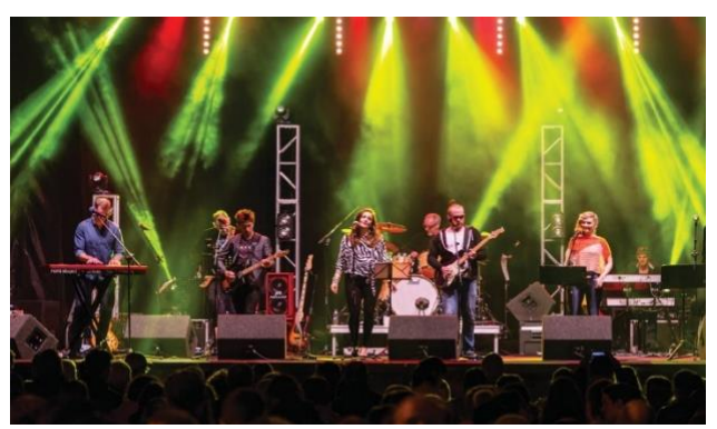
Sligo Summer Festival

We will continue to access various funding streams such as Leader, Fáilte Ireland, Heritage Council of Ireland and Sligo County Council and raise sponsorship that allows the company to deliver on its marketing objectives.