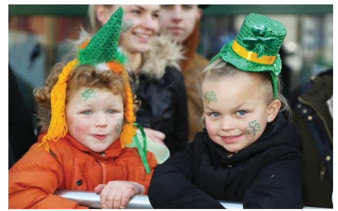
Sligo St Patrick's Day

Over the proposed five-year term there will be a notable increase in our operational delivery for the town centre as with local partnerships now established and long standing issues addressed such as the lack of Christmas lights and Lower Connaughton Rd, the company is now positioned to add additional projects selected by the BID members as priority actions.