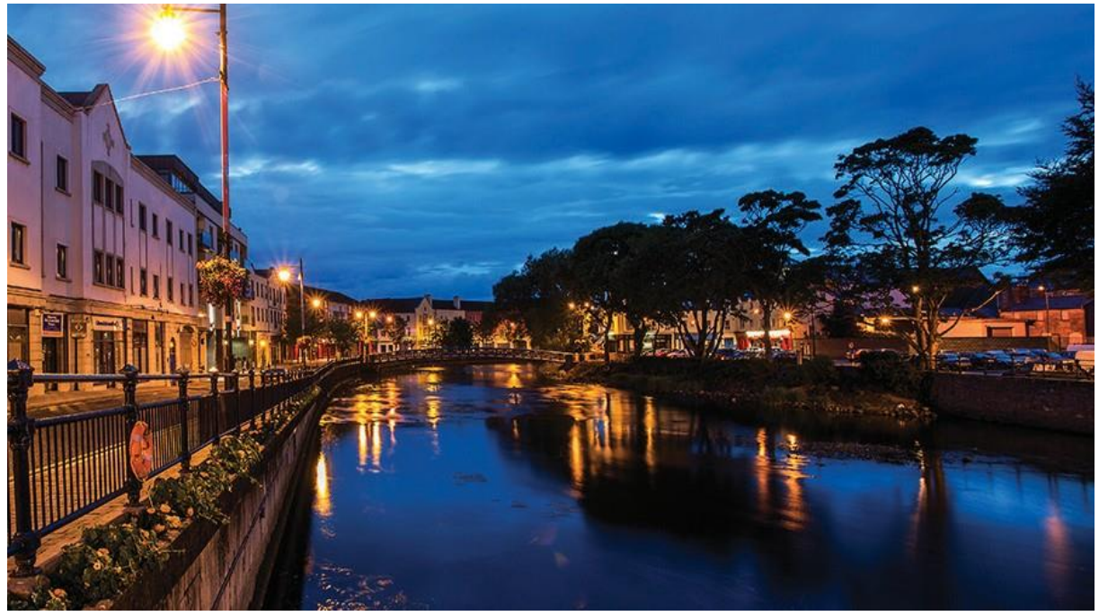
Rockwood Parade, Sligo